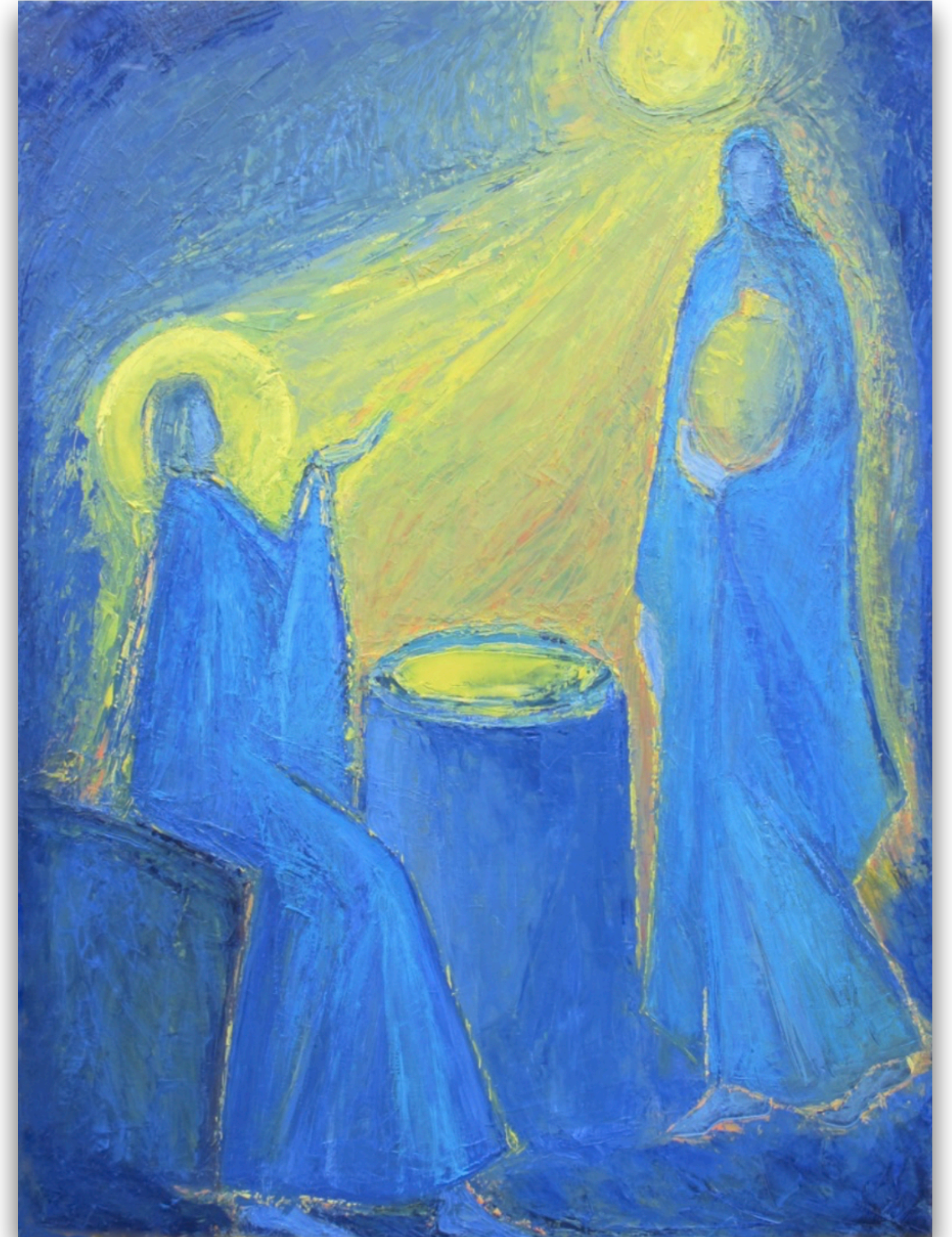
The Samaritan Woman. Magda Chamakoff (Fair Use) https://chmakoff.com/nouveau-testament/