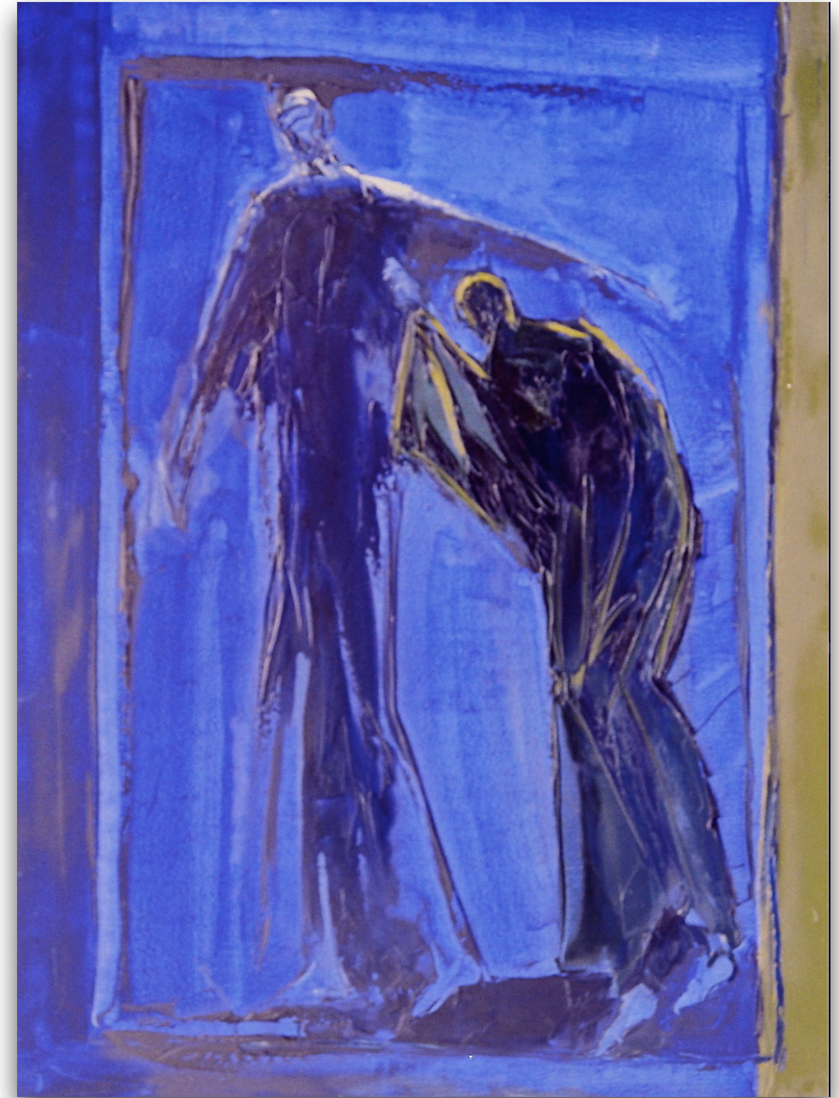
Appearance to Mary Magdalene.