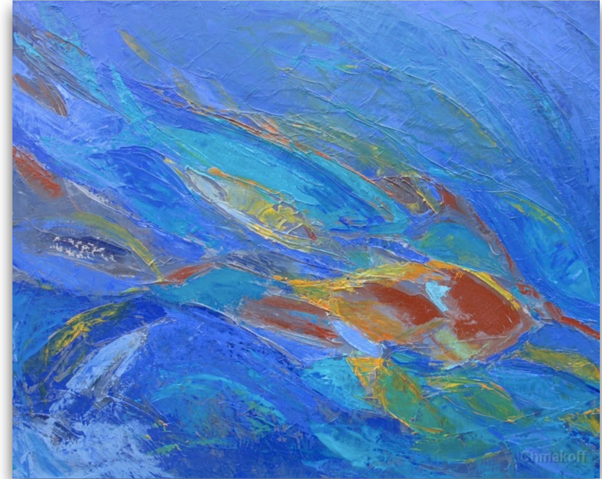
Jesus by the side of the lake: John 21:1 Magda Chamakoff (Fair Use) https://chmakoff.com/nouveau-testament/