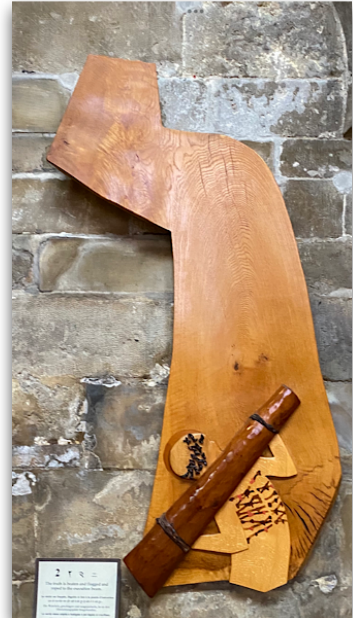
2. Jesus is beaten and flogged