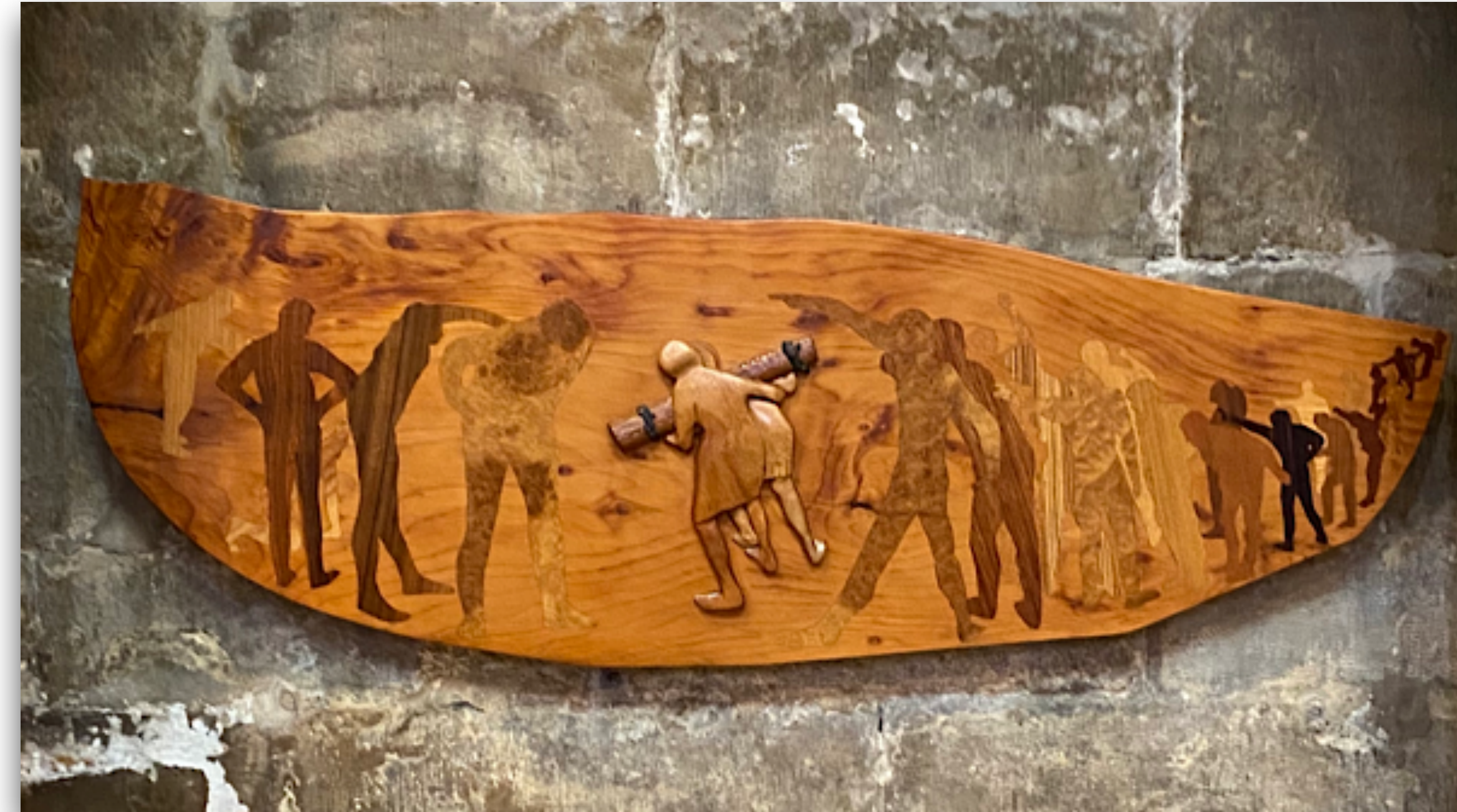
5. Jesus is helped by Simon of Cyrene

Jesus answered, “You say that I am a king. In fact, the reason I was born and came into the world is to testify to the truth. Everyone on the side of truth listens to me.” “What is truth?” retorted Pilate. With this he went out again to the Jews gathered there and said, “I find no basis for a charge against him. But it is your custom for me to release to you one prisoner at the time of the Passover. Do you want me to release ‘the king of the Jews’?” They shouted back, “No, not him! Give us Barabbas!” Now Barabbas had taken part in an uprising.