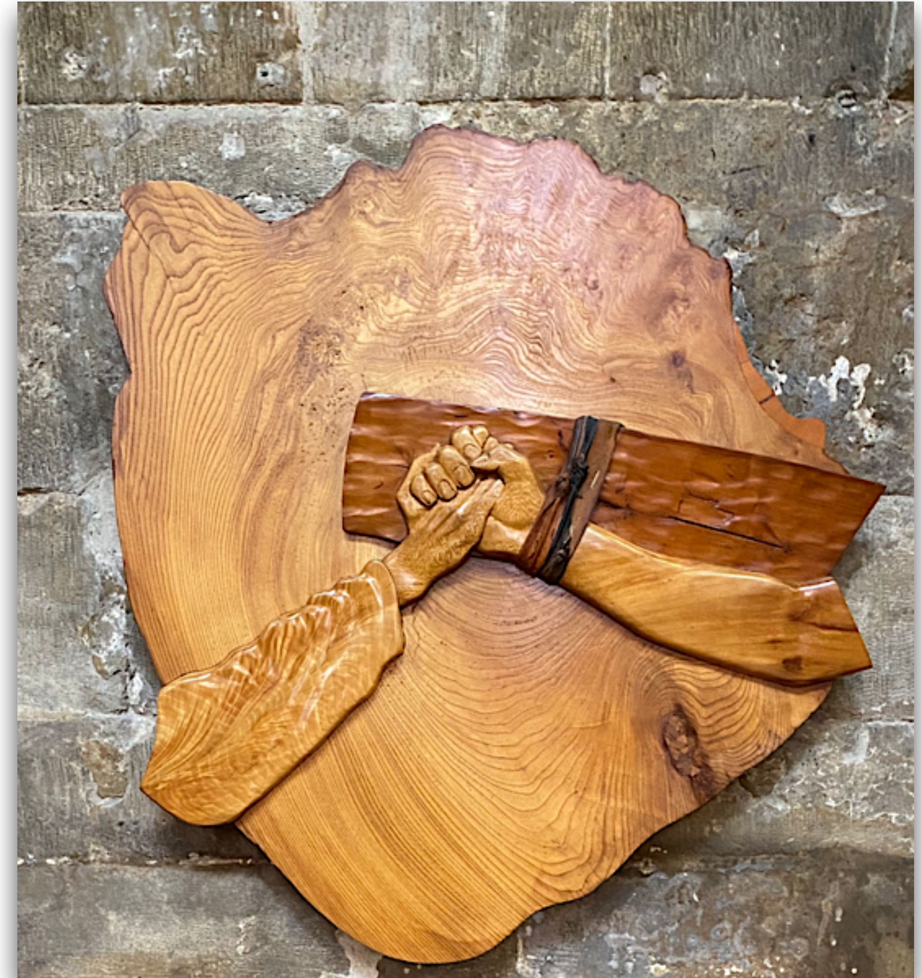
4. Jesus is helped by his mother