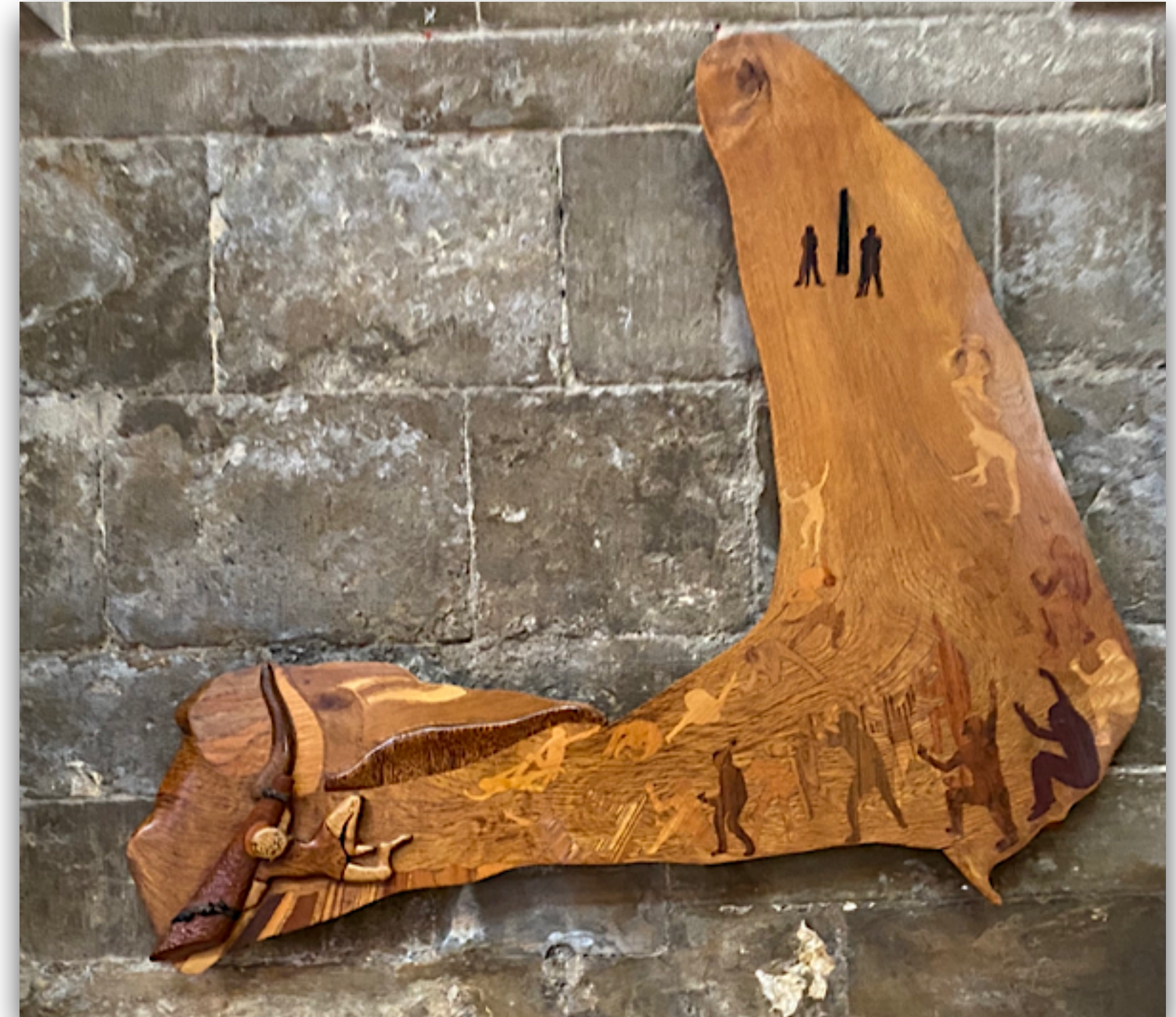
7. Jesus falls a second time

When Pilate heard this, he was even more afraid, and he went back inside the palace. “Where do you come from?” he asked Jesus, but Jesus gave him no answer. “Do you refuse to speak to me?” Pilate said. “Don’t you realise I have power either to free you or to crucify you?” Jesus answered, “You would have no power over me if it were not given to you from above. Therefore the one who handed me over to you is guilty of a greater sin.” From then on, Pilate tried to set Jesus free, but the Jewish leaders kept shouting, “If you let this man go, you are no friend of Caesar. Anyone who claims to be a king opposes Caesar.” When Pilate heard this, he brought Jesus out and sat down on the judge’s seat at a place known as the Stone Pavement (which in Aramaic is Gabbatha). It was the day of Preparation of the Passover; it was about noon. “Here is your king,” Pilate said to the Jews. But they shouted, “Take him away! Take him away! Crucify him!” “Shall I crucify your king?” Pilate asked. “We have no king but Caesar,” the chief priests answered. Finally Pilate handed him over to them to be crucified