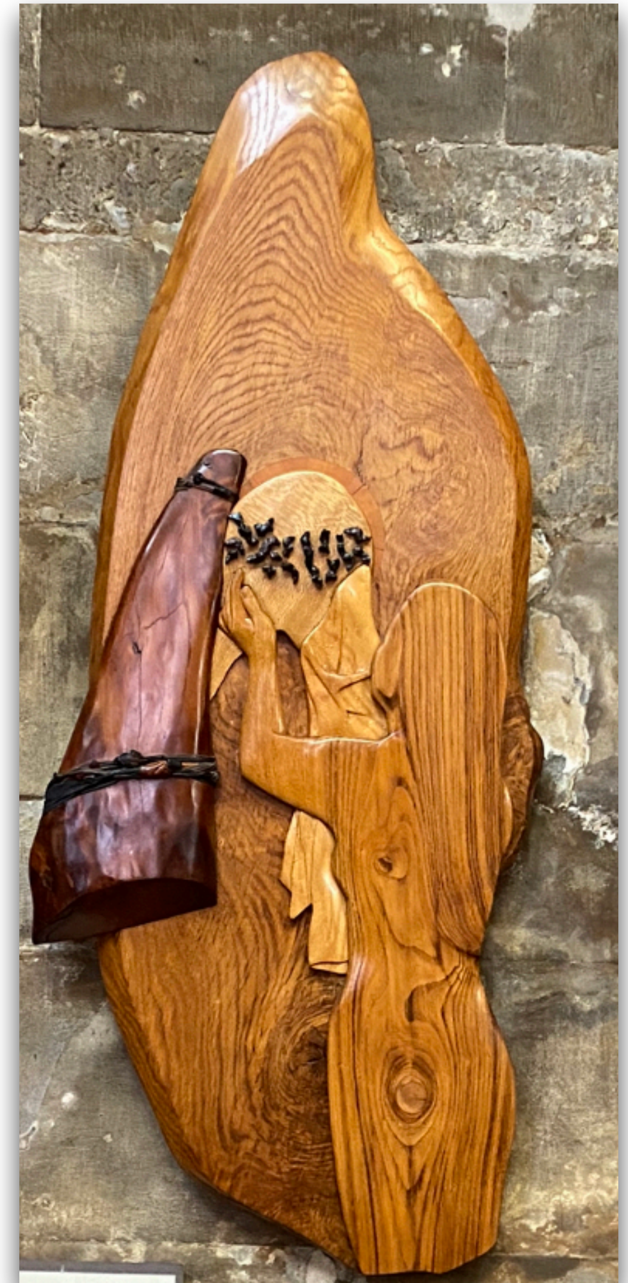
6. Jesus is helped by Veronica