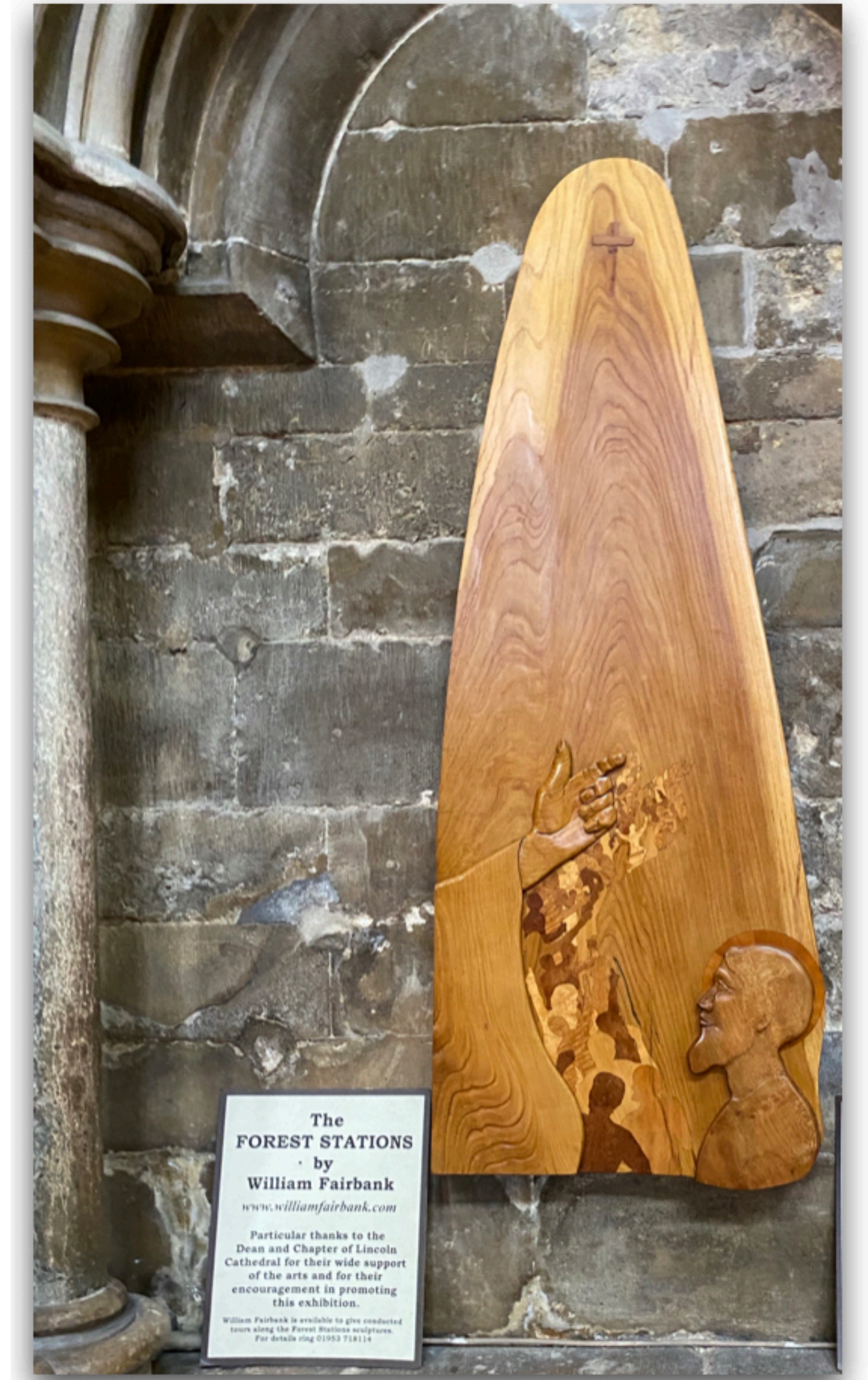
1. Jesus is condemned to death by the crowd