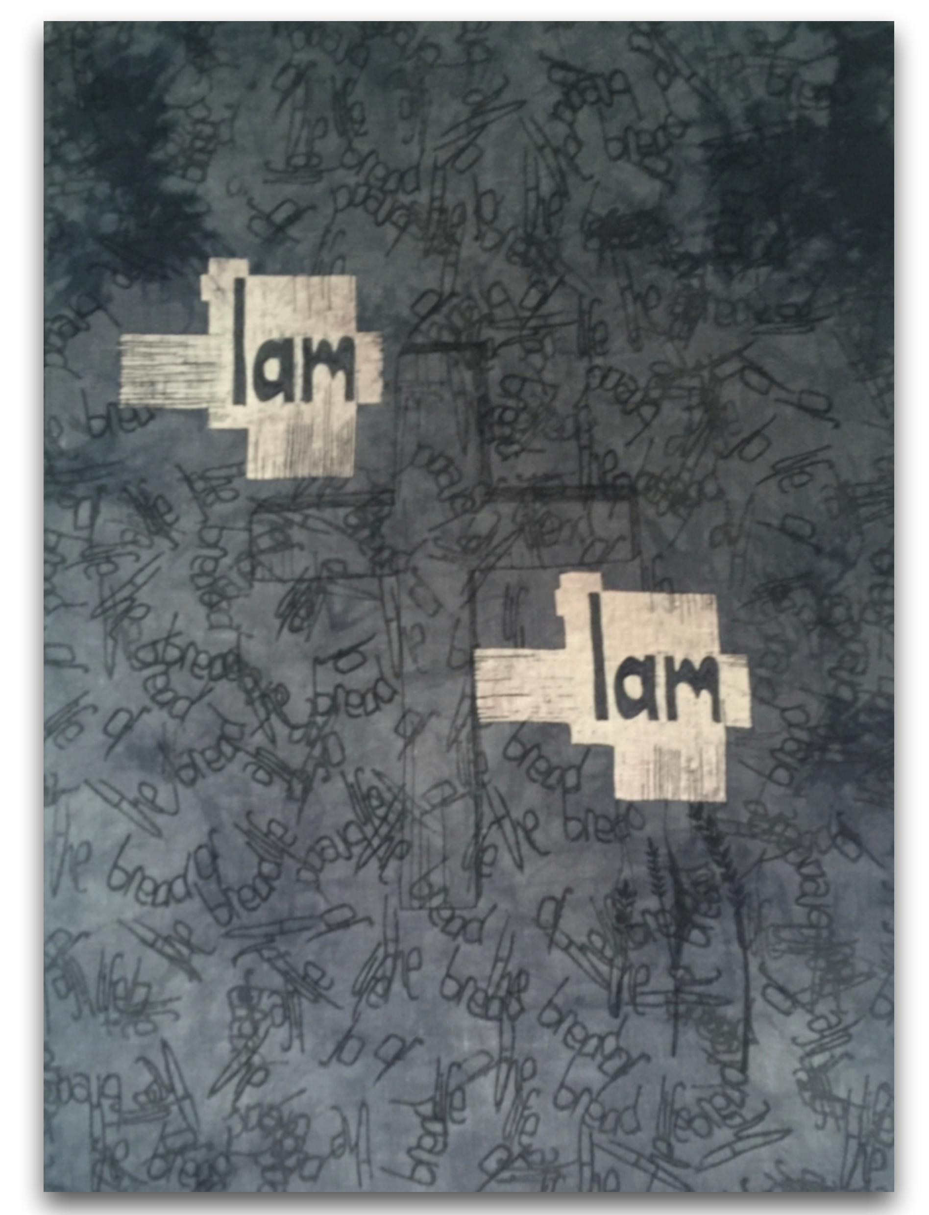
I am the bread of life by Jane Allen - Used with permission