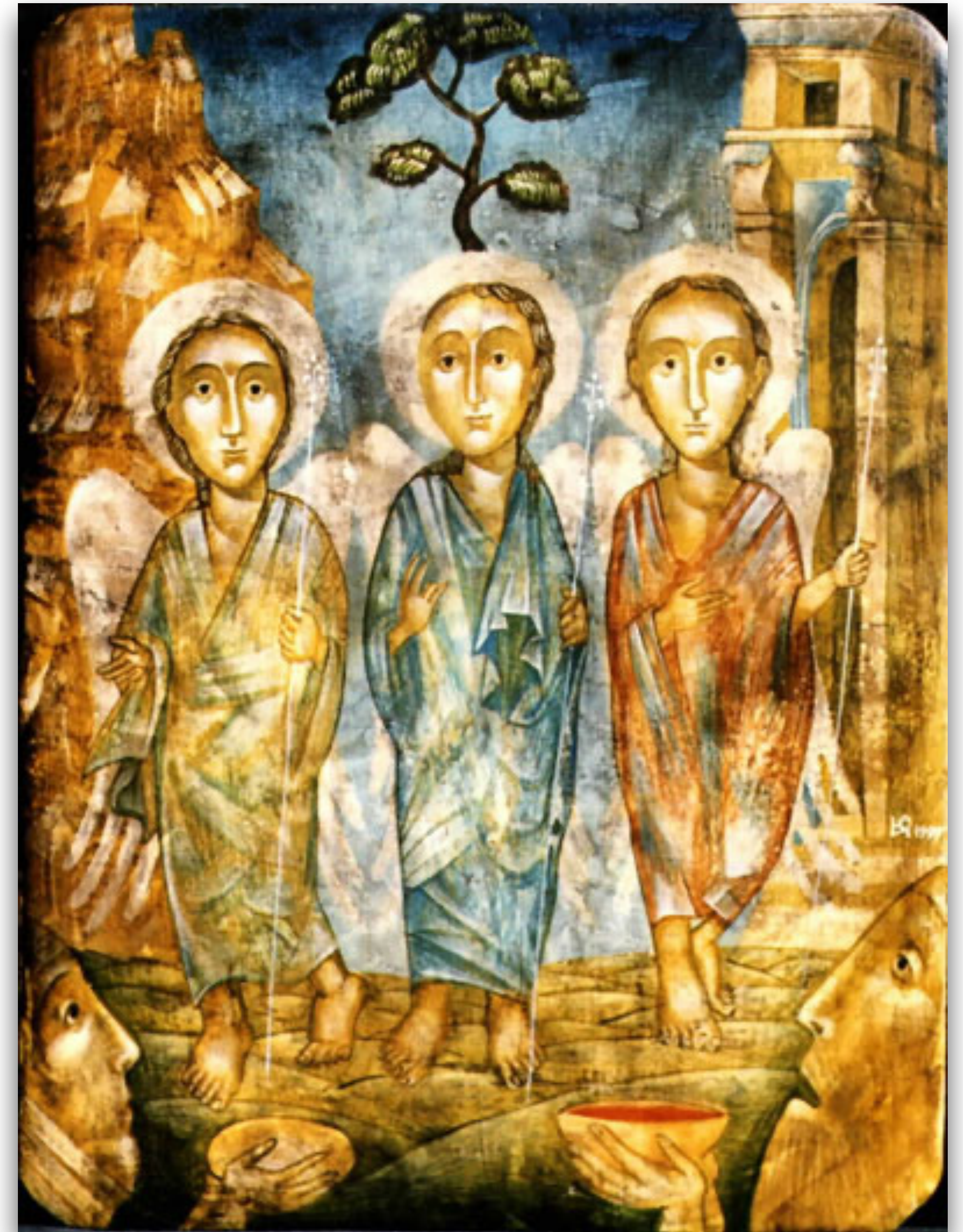
Trinity by Julia Stankova.