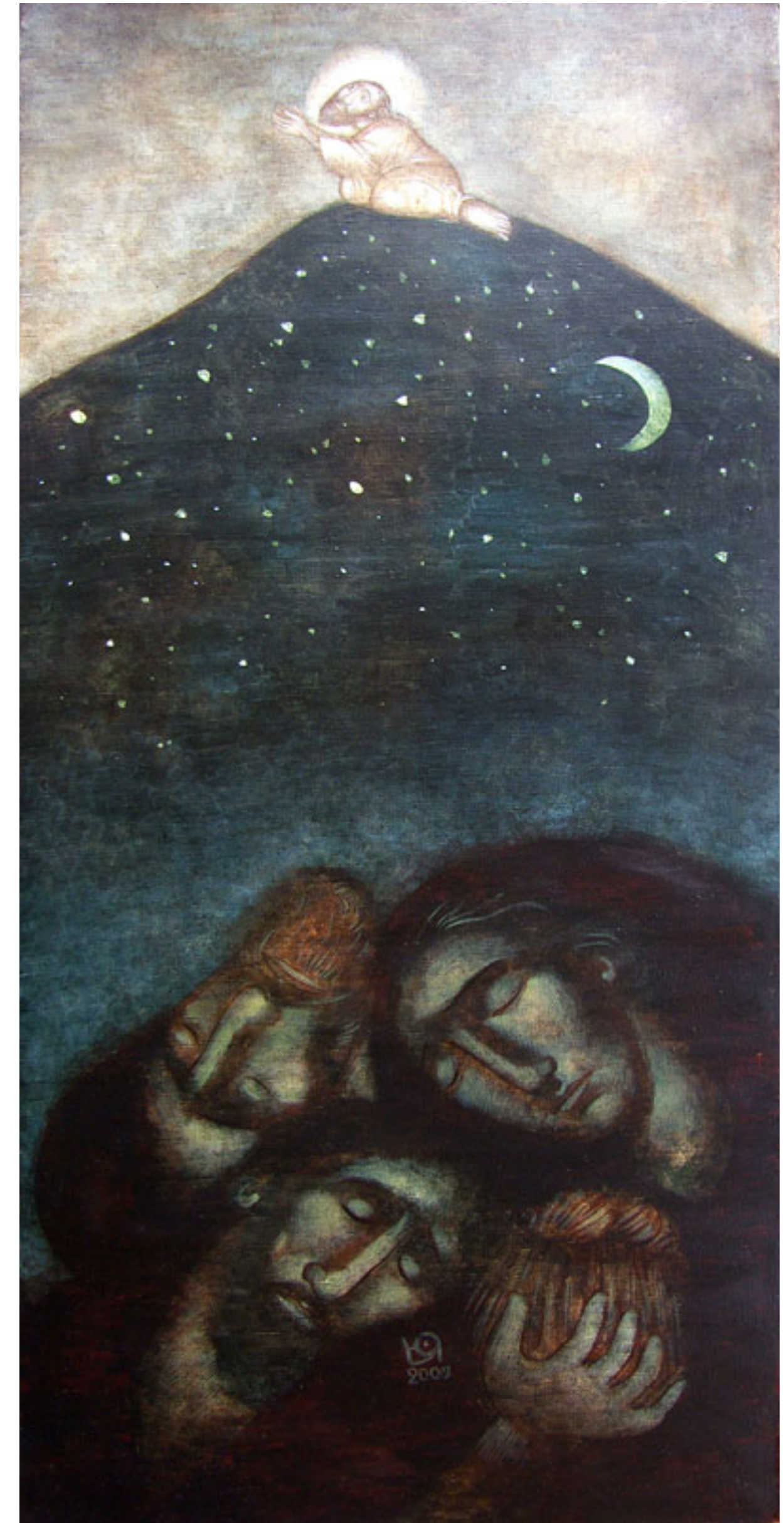
Gethsemane by Julia Stankova. Used with permission. http://www.juliastankova.com/home.html