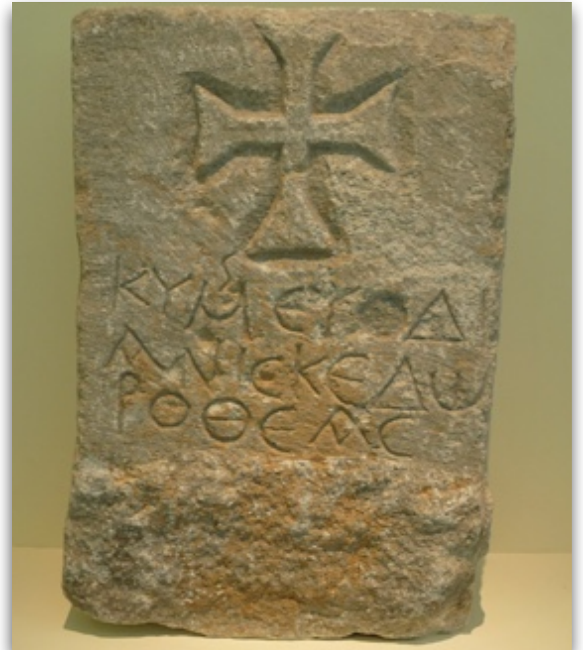
An engraved cross, Philippi.