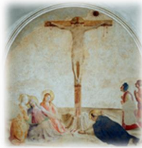
Crucifixion with the Virgin, Saints and a friar at the foot of the cross. Fresco by Beato Angelico and followers, cell 40, Monastery of San Marco in Florence.