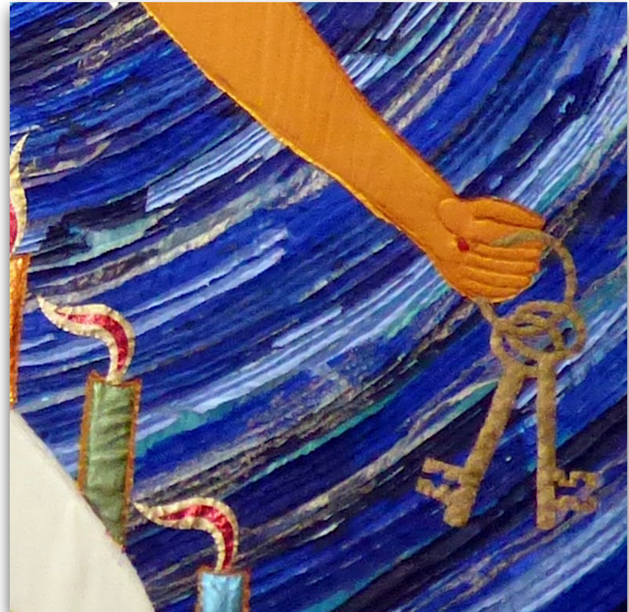
FIRST & FINAL (detail) by Jacqui Parkinson, Threads Through Revelation