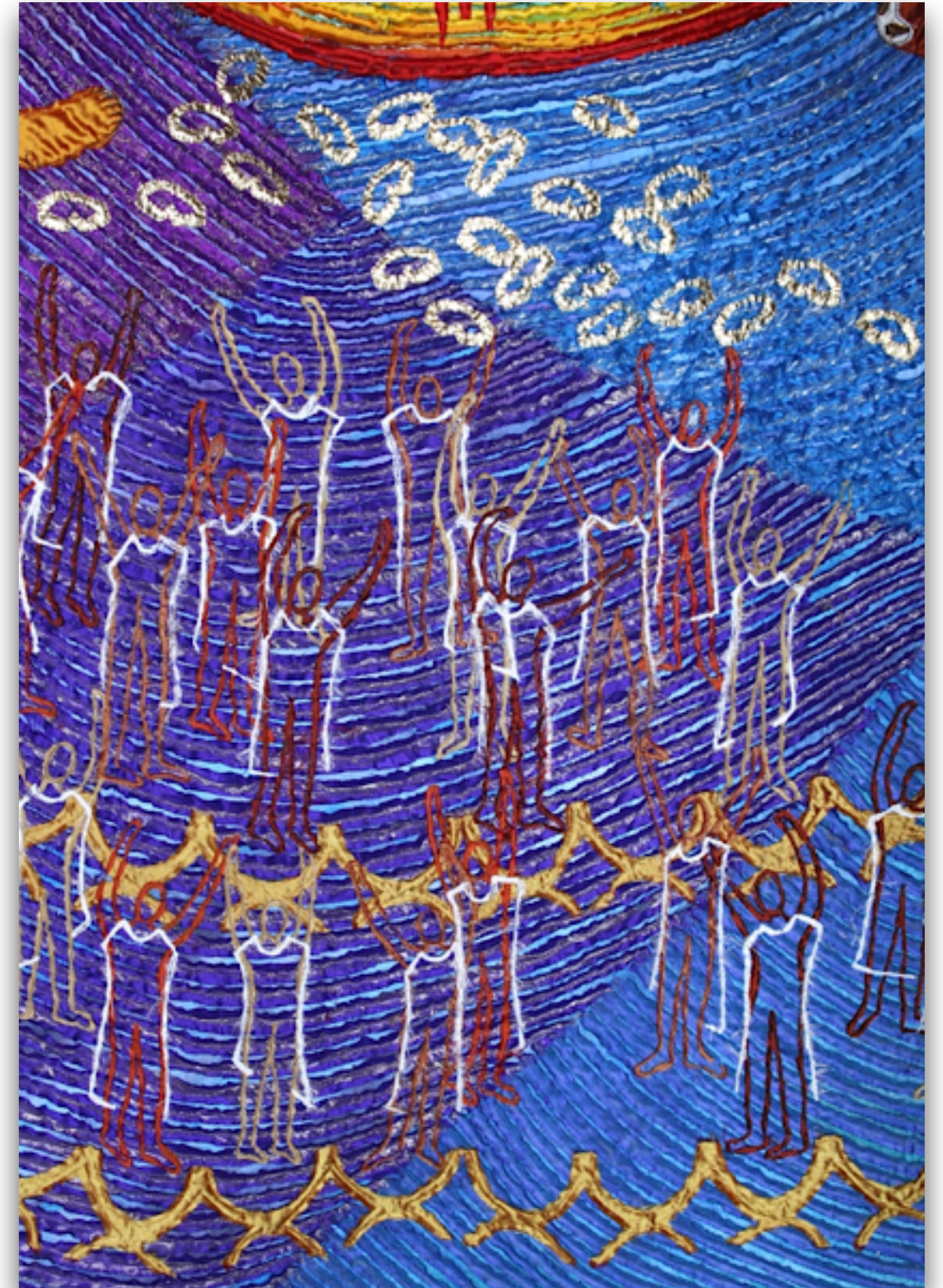
THE THRONE ROOM by Jacqui Parkinson, Threads Through Revelation