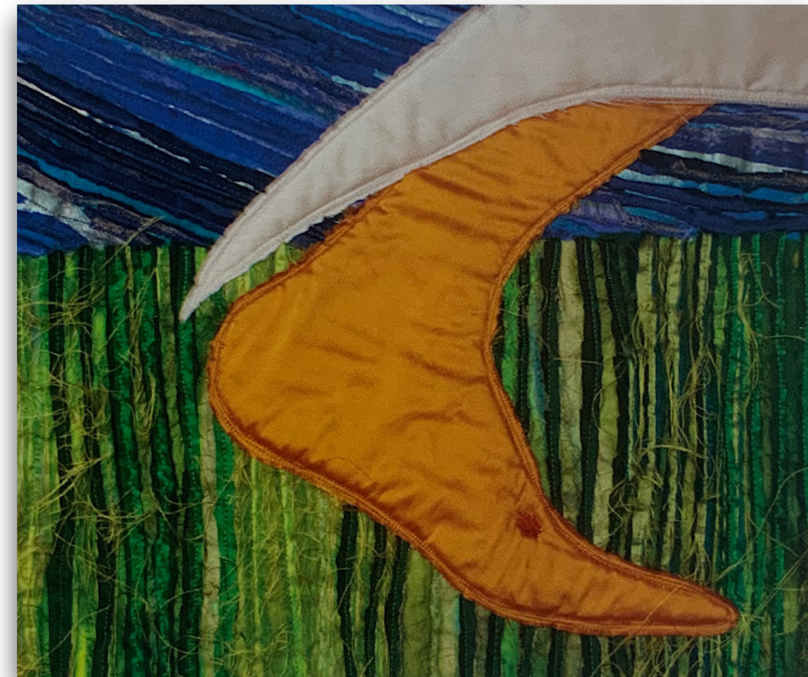
FIRST & FINAL (detail) by Jacqui Parkinson, Threads Through Revelation