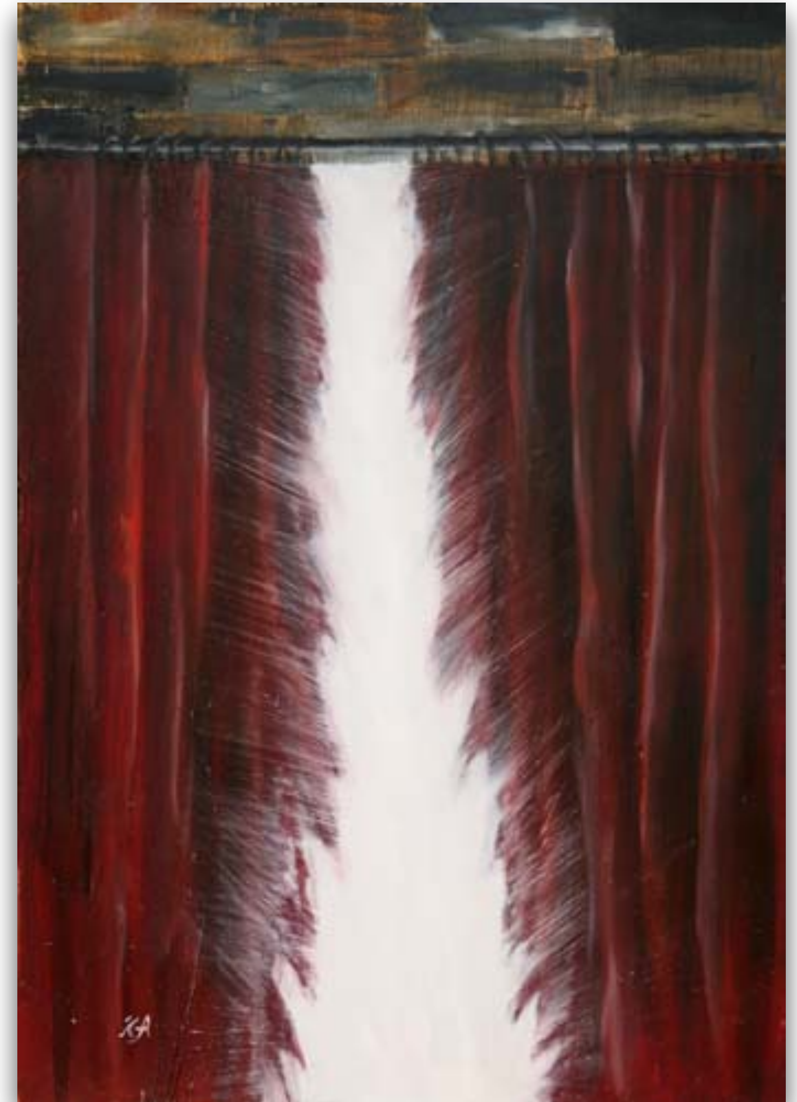
Deliverance from Law by Kate Austin used with permission

THE HOLY BIBLE, NEW INTERNATIONAL VERSION®, NIV® Copyright © 1973, 1978, 1984, 2011 by Biblica, Inc.® Used by permission. All rights reserved worldwide.