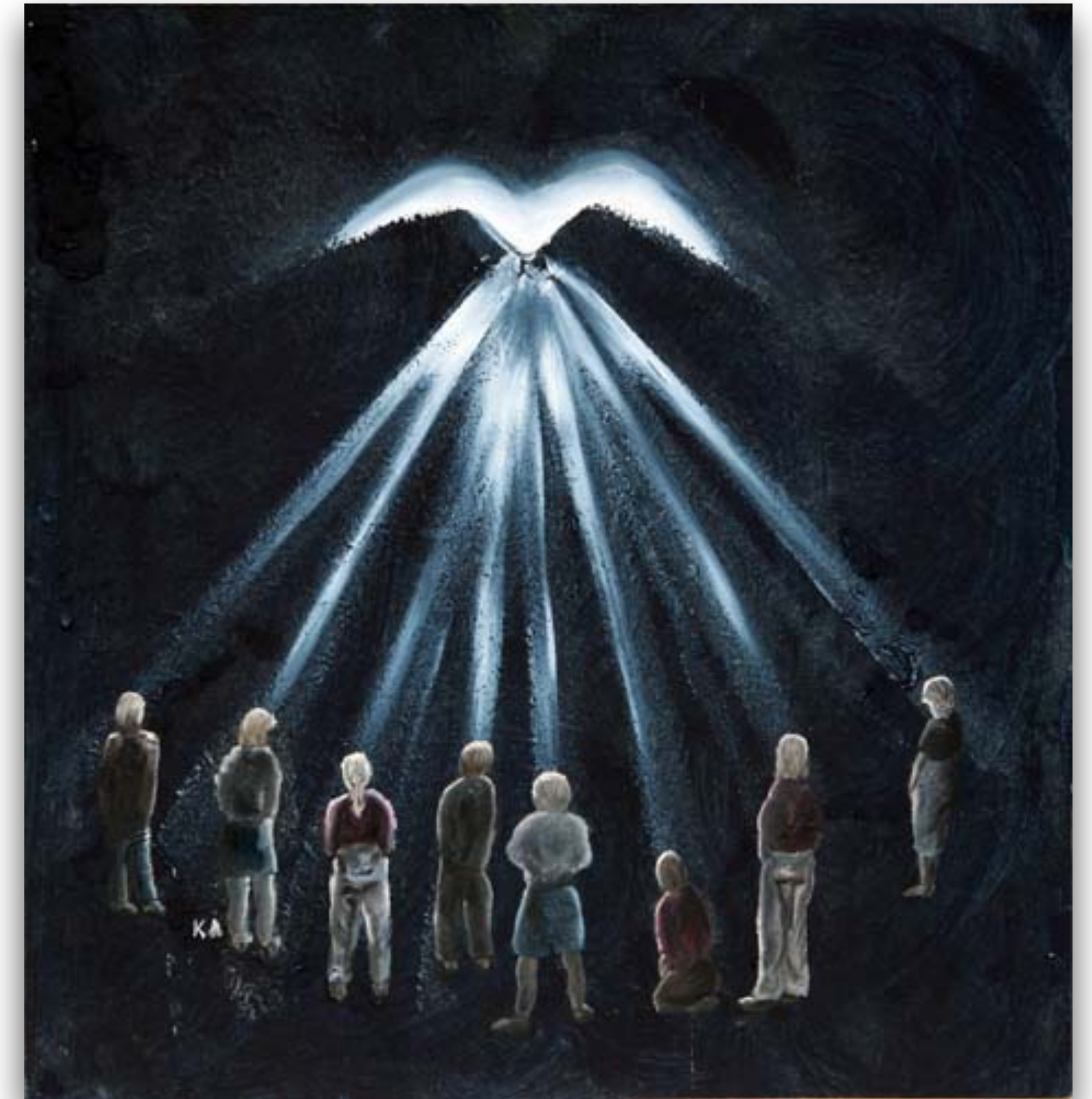
You are light by Kate Austin used with permission