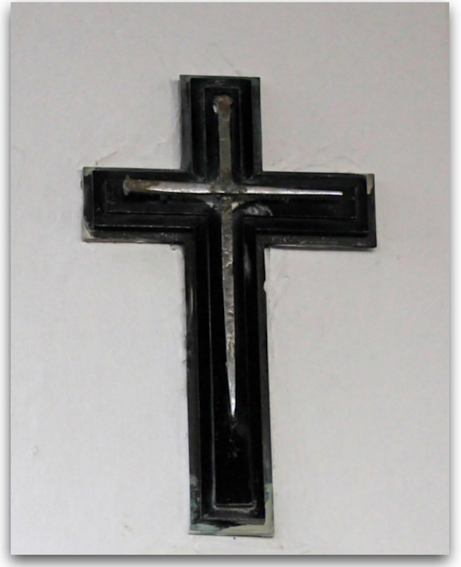
Cross of Nails Coventry Cathedral