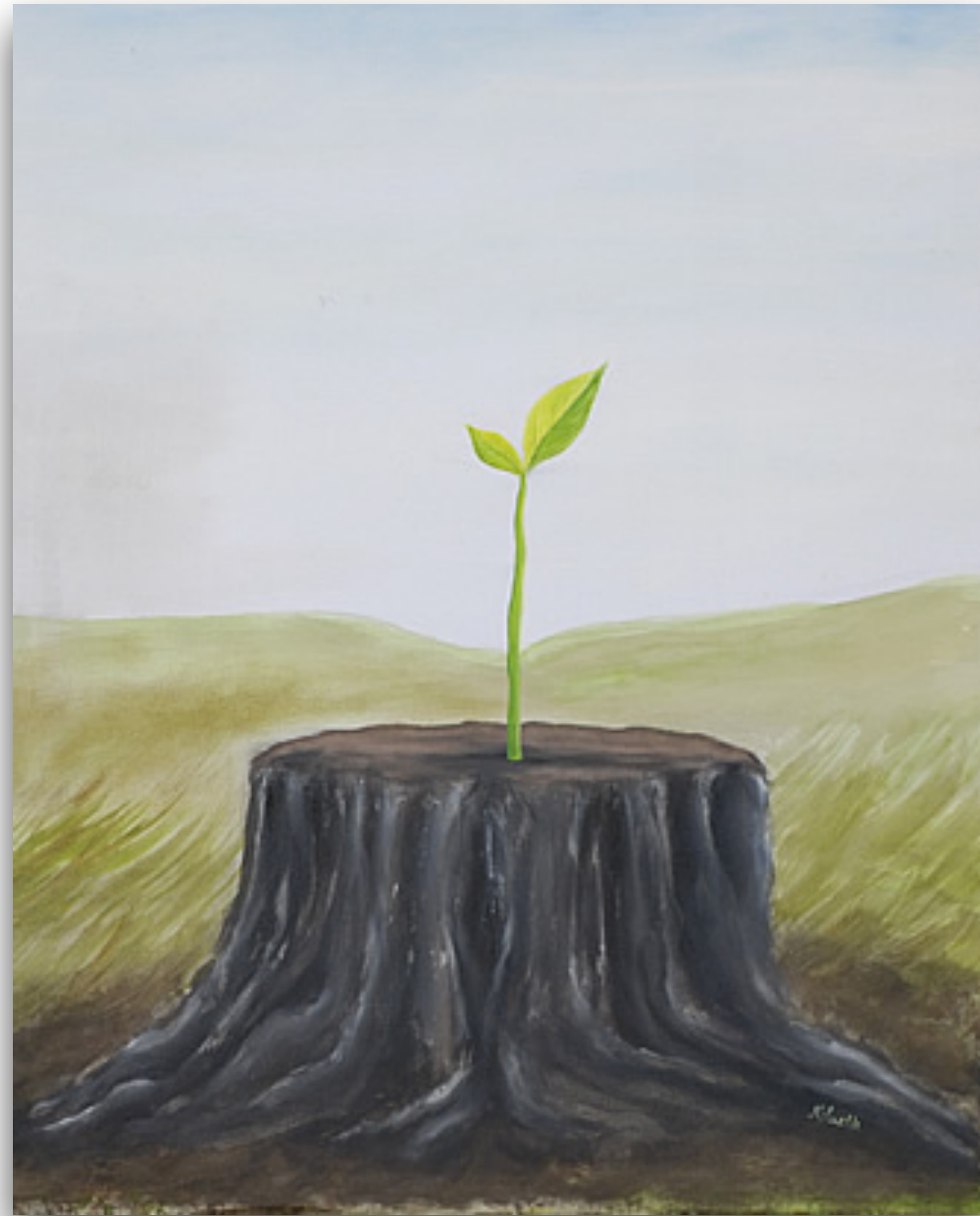
New Life by Kate Austin

We lie still like sprinkled spices trying to delay inevitable decay, wrapped up tight stone cold and futile.