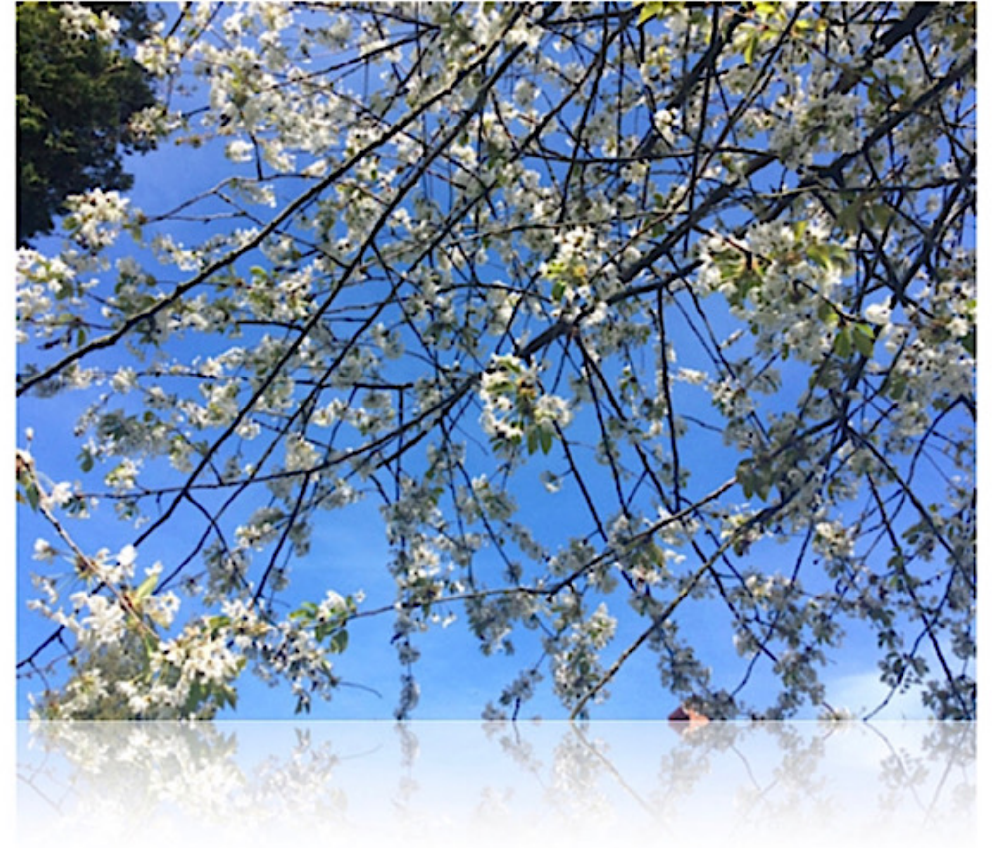
Cherry Blossom

You might want to listen to the Sons of Korah sing a version of Psalm 1 here .