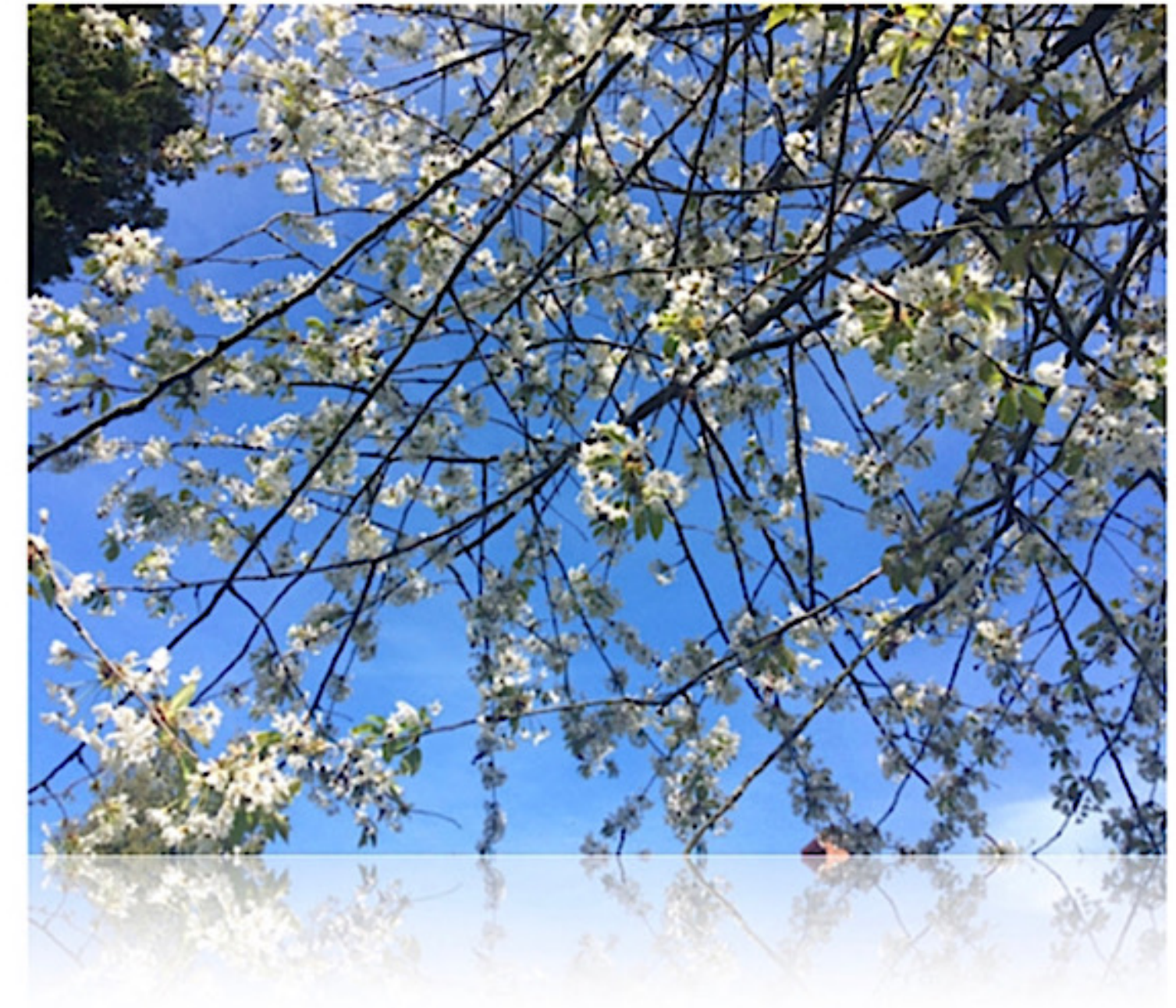
Cherry Blossom