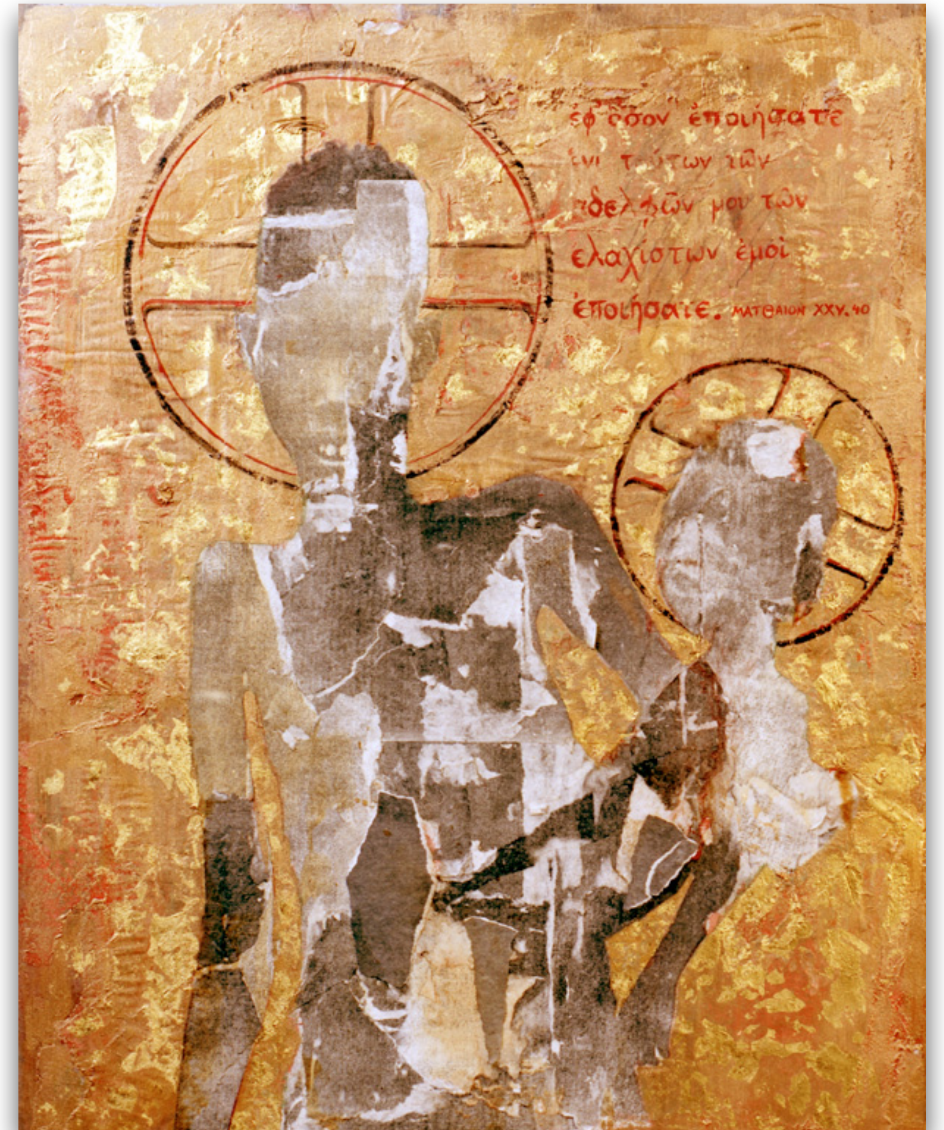
Between the image and the flame By Paul Hobbs. Used with permission. http://www.arthobbs.com/