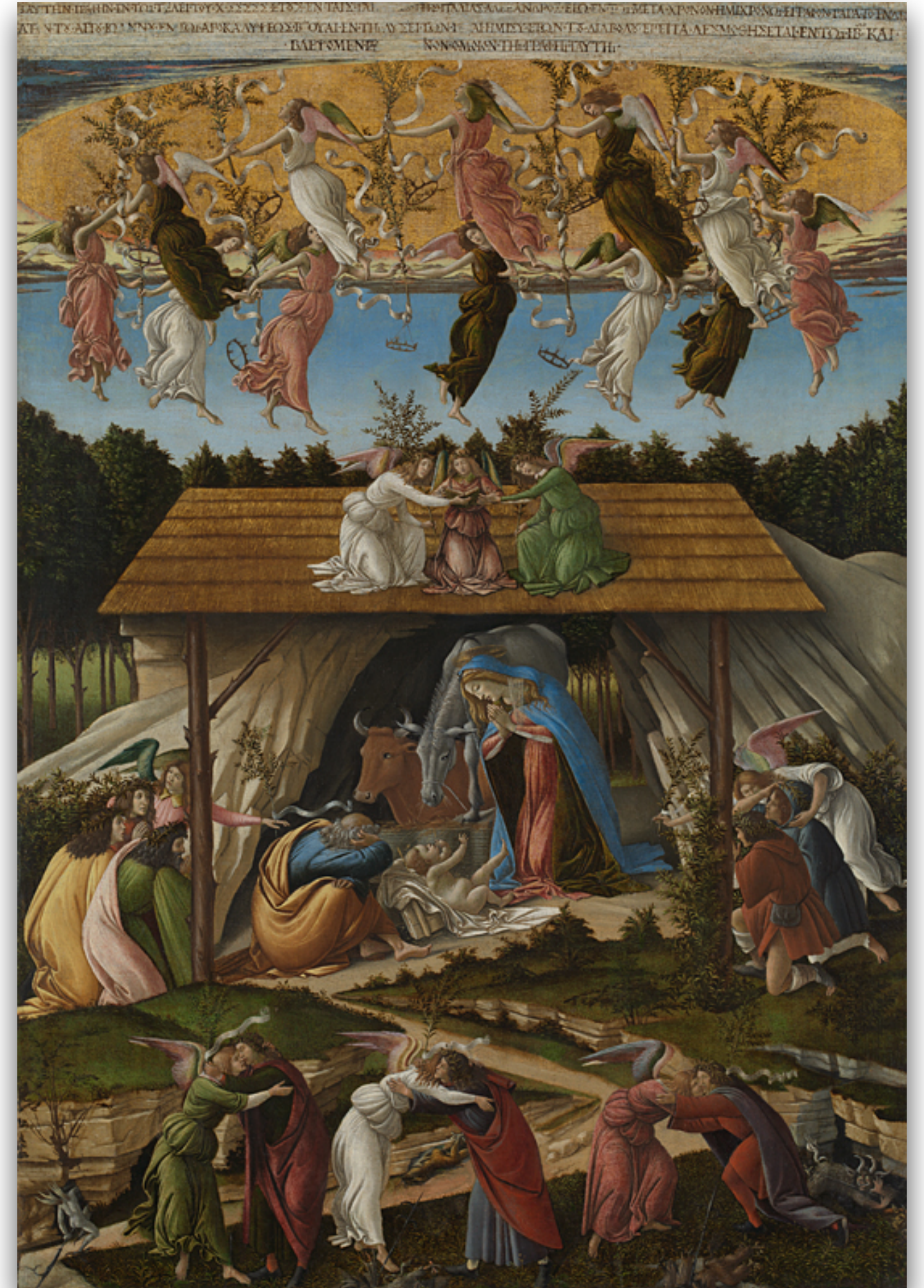
Mystic Nativity, Botticelli