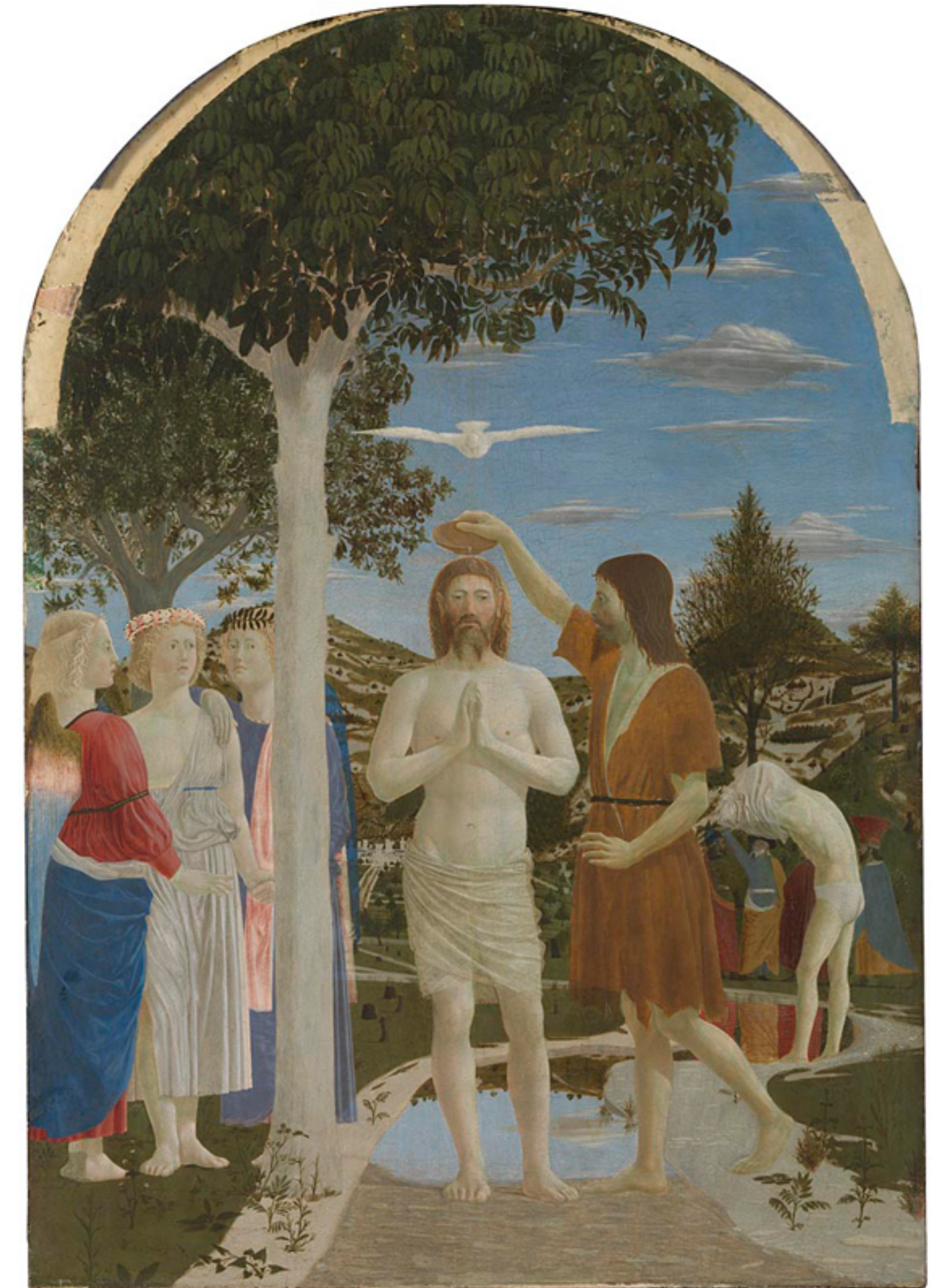
The Baptism of Christ, Piero Della Francesca CC BY-NC-ND 4.0 https://www.nationalgalleryimages.co.uk/asset/221/