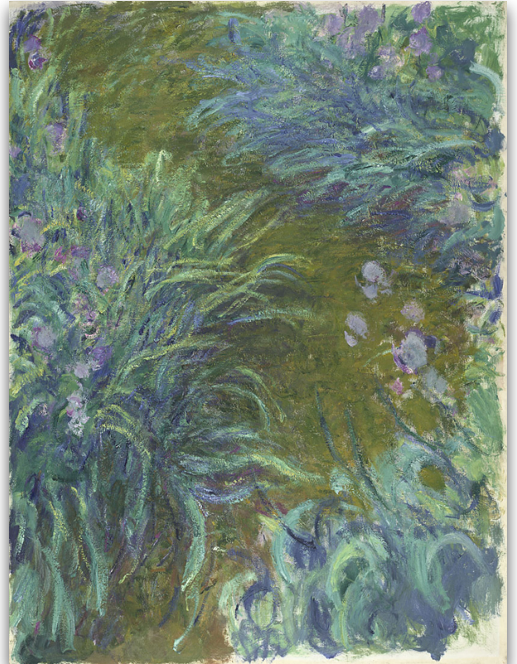
Irises, Monet