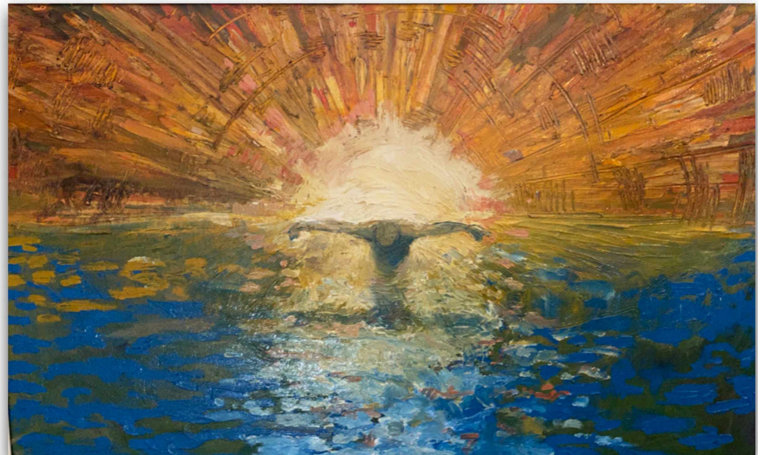
Jesus, the light of the world St George's Cathedral Jerusalem (Fair Use)