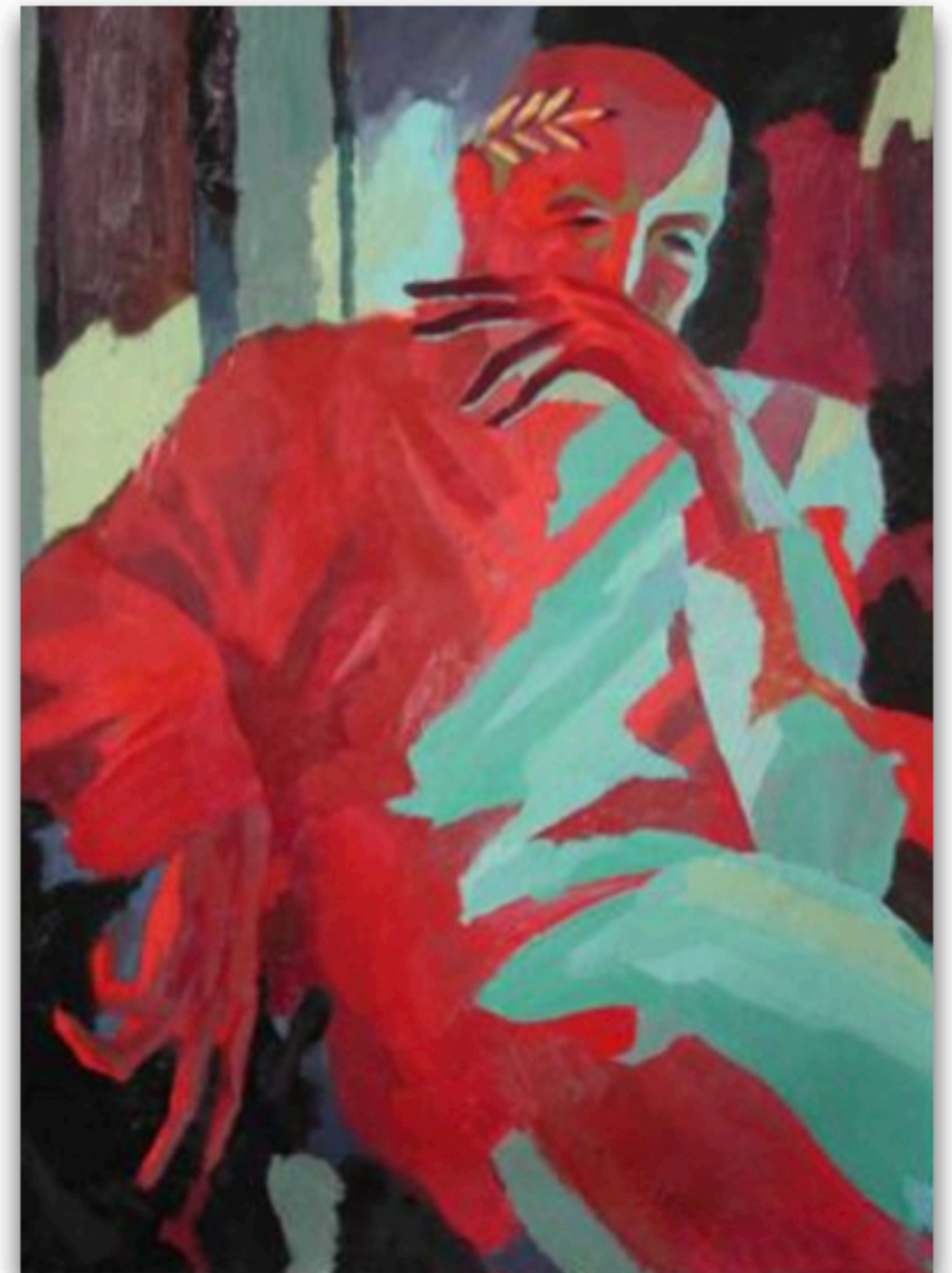
Politics Pilate Kokorina Kseniya (Fair Use)